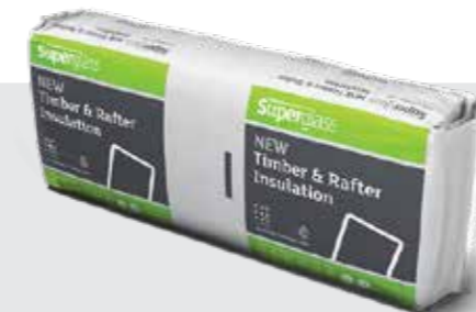
Superglass Timber & Rafter Batts 32/35.

Combining an external wall, vapour permeable breather membrane with an internal air and vapour control layer also minimises the risk of interstitial condensation within the insulated wall structure.