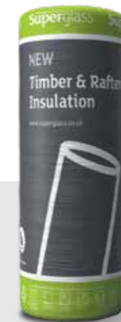
Superglass Timber & Rafter Rolls 32/35/40.