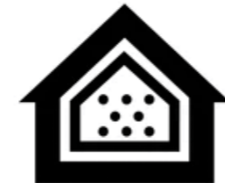
Protect sealing tapes.