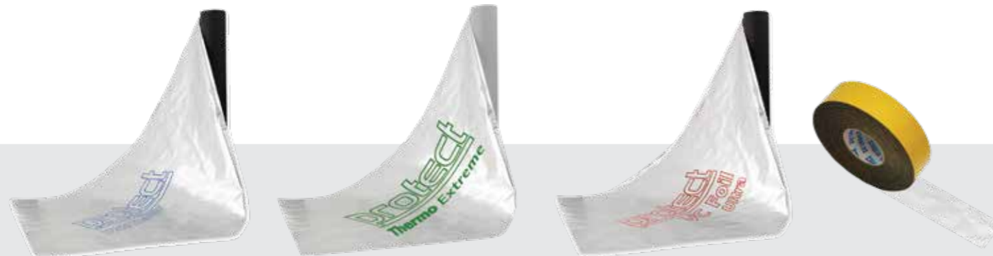
Protect TF200 Thermo and Thermo Extreme insulating breather membranes for external walls.

Specifying using a fabric first approach for the building envelope can deliver valuable energy-saving opportunities, improved thermal efficiency and lower carbon emissions. Glass mineral wool insulation delivers high levels of thermal performance in timber frame walls and roofs for the lifetime of the building. This energy efficiency can be enhanced using external and internal reflective wall membranes with strong aged thermal resistance as a system within still air cavities. Operating as a radiant barrier, the use of reflective membranes helps to retain heat within the structure, thereby contributing to a low U-Value for the wall element and helping to ensure compliance to Building Regulations Part L (England & Wales) and Technical Handbook Section 6 (Scotland).