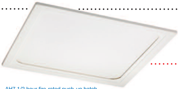
AH7 1/2 hour fire-rated push-up hatch