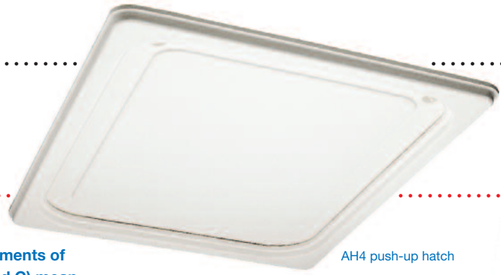
AH4 push-up hatch

Glidevale loft access hatches have been designed and engineered under BS EN ISO 9001 to meet these latest demands.