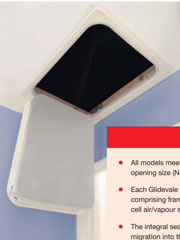
AH5 Part L loft hatch

All frames except for the AH6 are injection-moulded polypropylene.