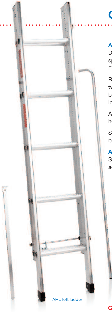
AHL loft ladder