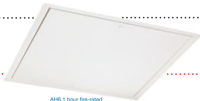
AH6 1 hour fire-rated hinge-down hatch