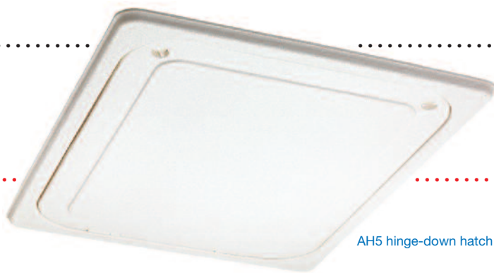
AH5 hinge-down hatch